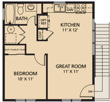
Optional Carriage House