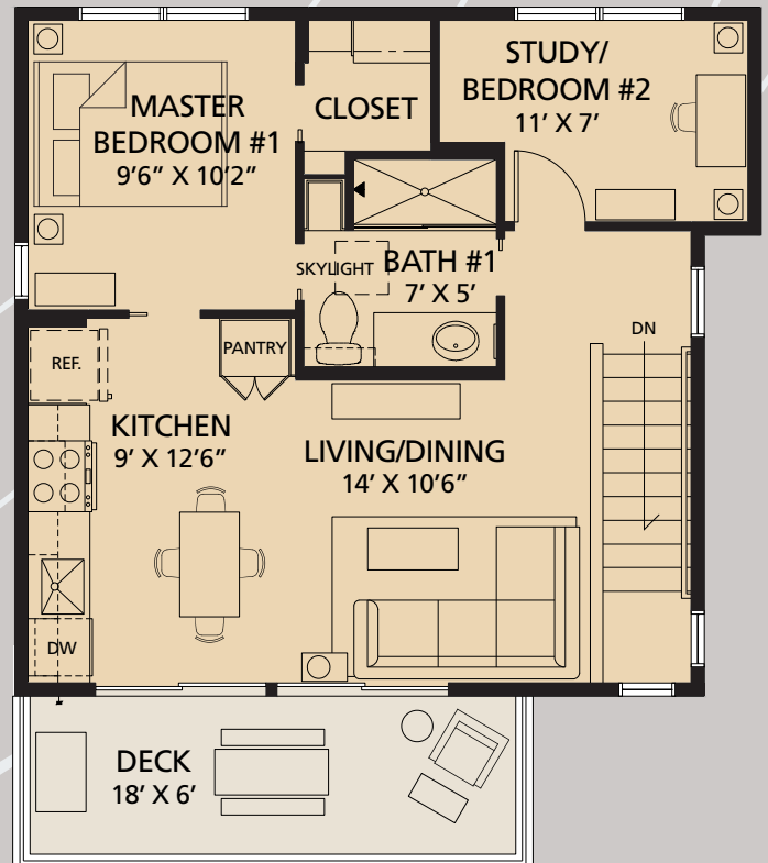
Upper Level - No Cantilever