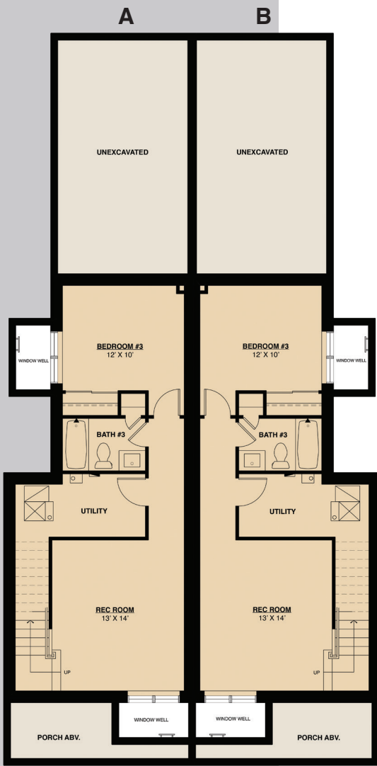
Lower Level 8 ft 9" ceilings