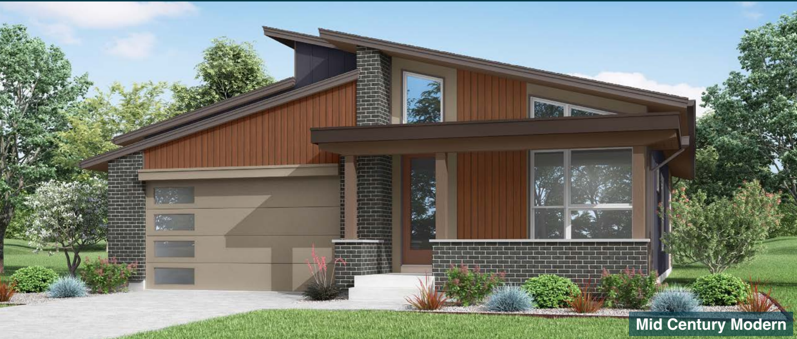
Mid Century Modern