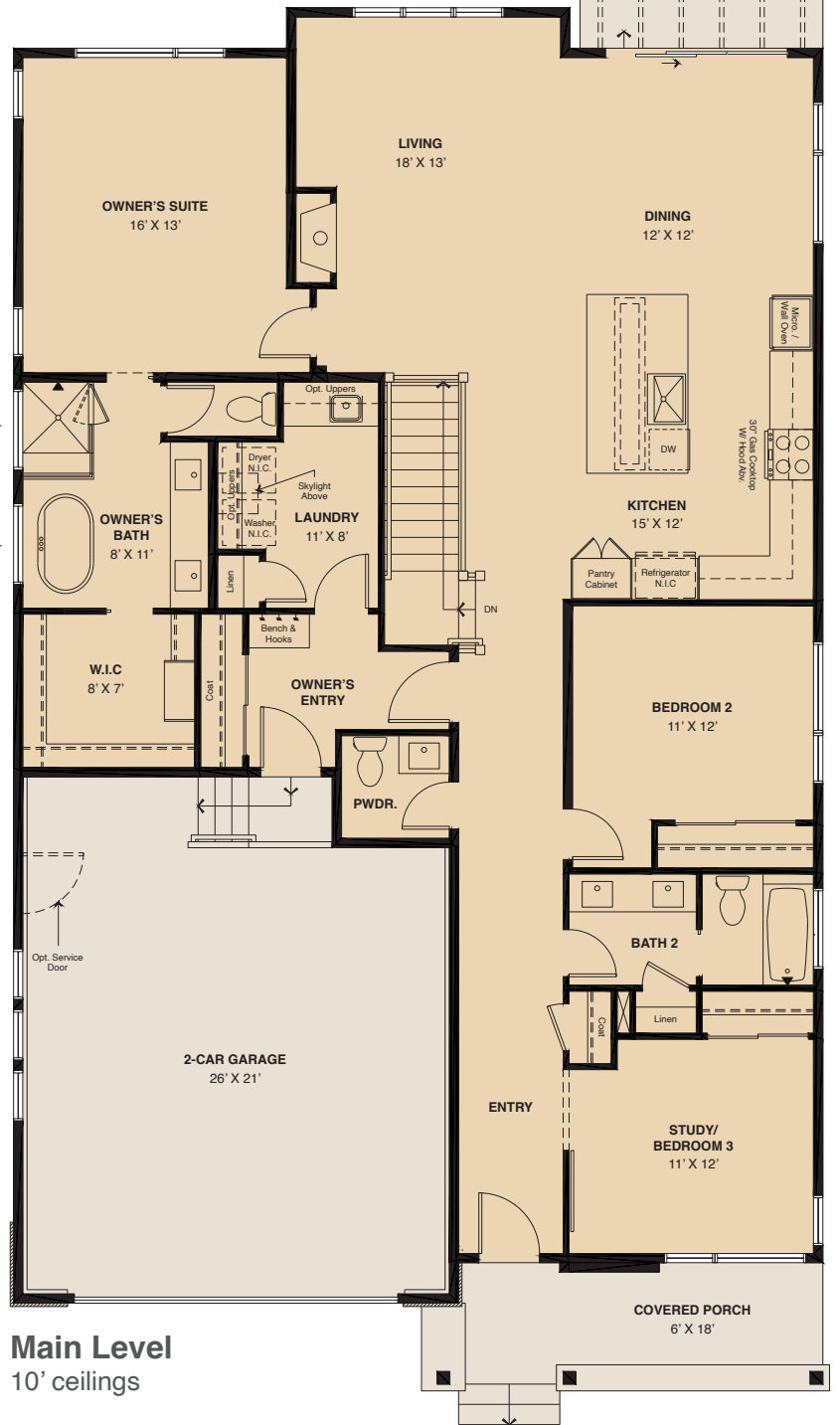
Main Level 10' ceilings